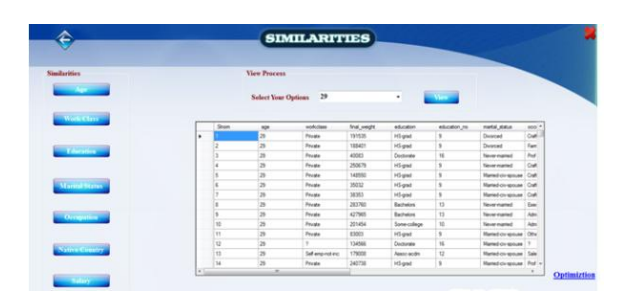
Figure 1: Time sensitive queries result analysis.

TIME is an important dimension of relevance for a large number of searches. Research on searching over such collections has largely focused on retrieving topically similar documents for a query. For a large family of Queries the time dimension are ignoring or not fully exploiting can be detrimental. We should consider not only the document topical relevance but the publication time of the documents as well. There are two motivational points on searching over news archives.